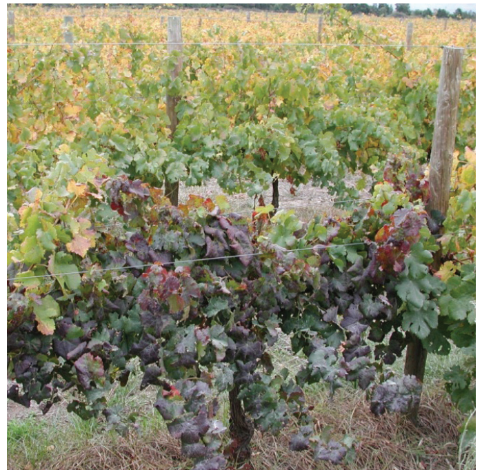
Figure 2: Typical Shiraz disease symptoms late in the growth season. Leaves tend not to drop off in autumn.

Shiraz disease grapevines are very easy to observe in early winter (Fig. 2).