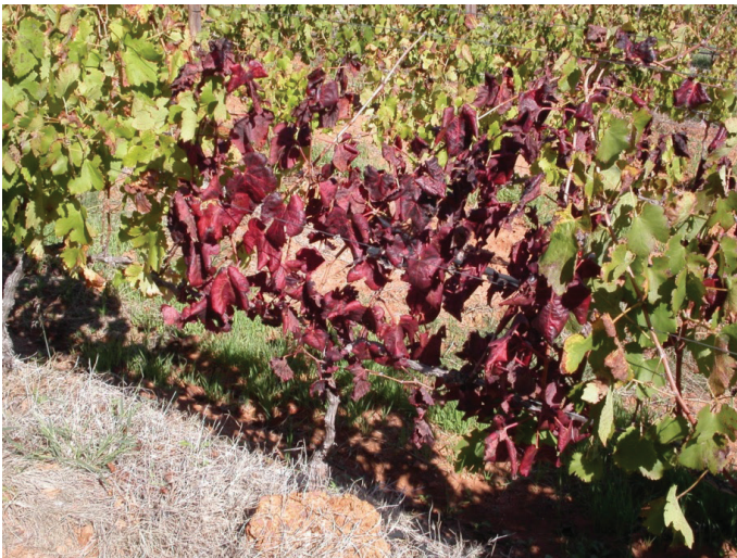
Figure 3: Shiraz decline disease on a Shiraz clone 99 vine.

The cause of this disease is not fully understood.