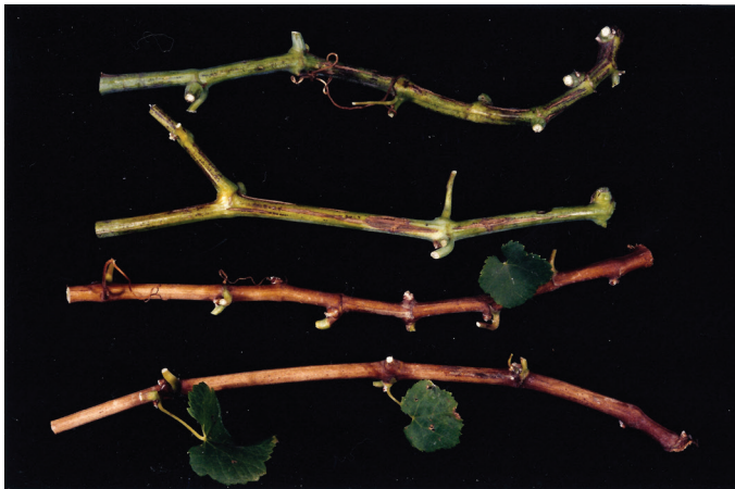
Figure 1: Shoots that failed to lignify as a result of Shiraz disease.

In its earliest phases of development the disease symptoms look like those of leafroll but after a few seasons the shoots fail to lignify and become "rubbery" (Fig. 1).