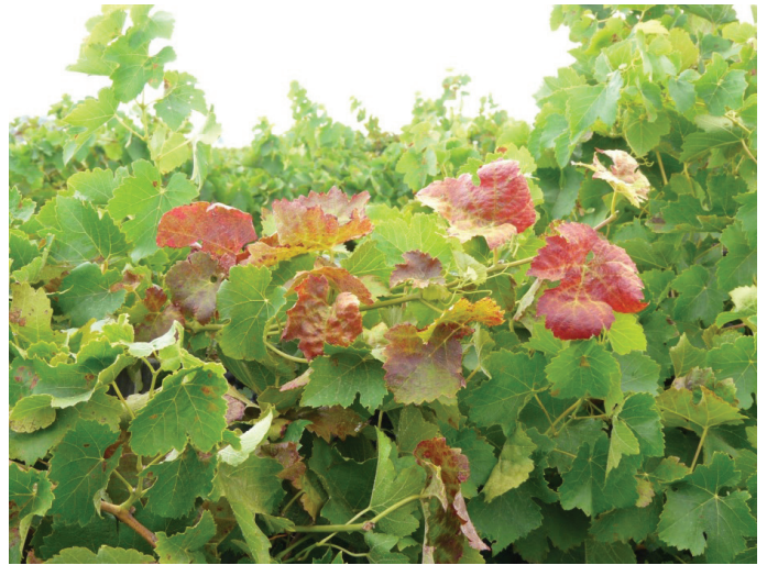
Figure 4: Aster yellows phytoplasma symptoms on Pinotage.

Occasionally, the reddening of leaf blade in the interveinal zones between secondary veins resembles those of leafroll diseases, but the leaf margins do not roll downward. Also, in leafroll infected red varieties the secondary and tertiary veins remain green.