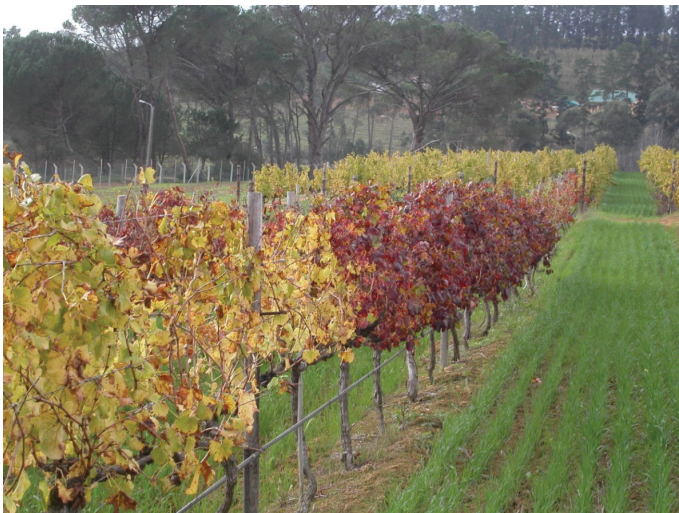
Figure 1: "Runs" of two or three adjacent leafroll infected grapevines, indicative of infection from a single infected vine to adjacent plants in the row.